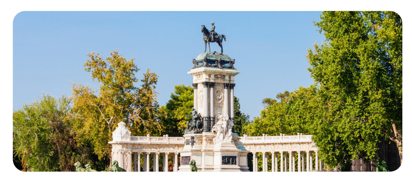
If you're still curious to explore the other treasures to be found in Madrid, there are numerous charming and unusual corners that are guaranteed to captivate you.